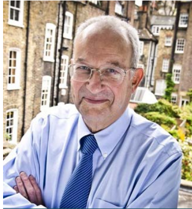
Chancellor Lord Sainsbury of Turville