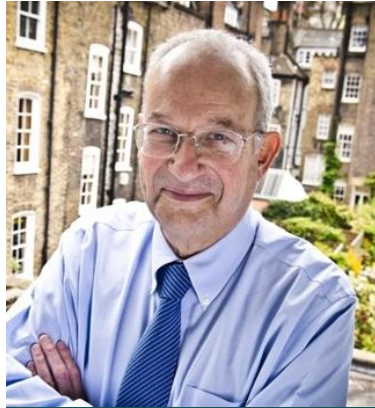
Chancellor Lord Sainsbury of Turville